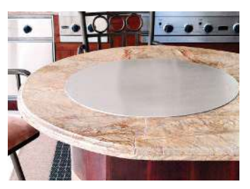
Manufacturer reserves the right to change, alter. update or discontinue any model without notice Shown accessories not included