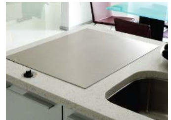
Manufacturer reserves the right to change, alter, update or discontinue any model without notice. Shown accessories not included.