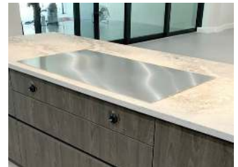
Manufacturer reserves the right to change, alter, update or discontinue any model without notice. Shown accessories not included.